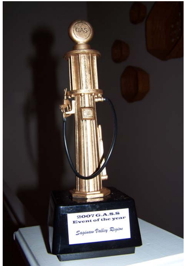
2007 Great American Solo Series Event of the Year Trophy presented to Saginaw Valley