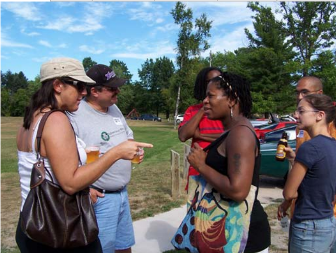
Post 40th Anniversary Rally Discussions