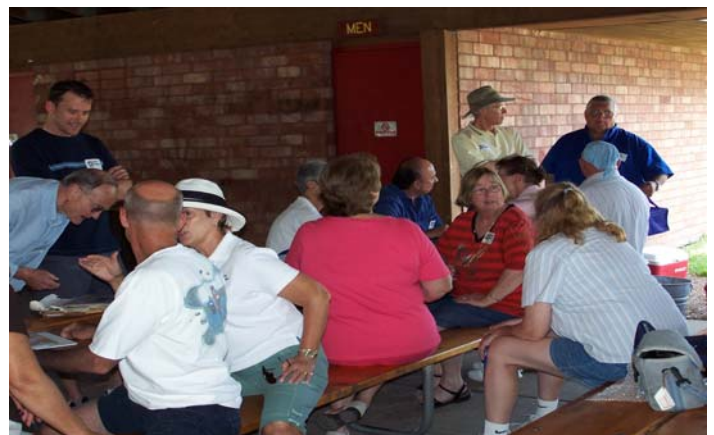
40th Anniversary Picnic