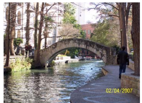
On the right Just on of the sites on the way to the Alamo walking along the River Walk.