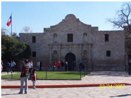
On the left. Right in the middle of San Antonio set the Alamo. Seems different in person than in the history books.