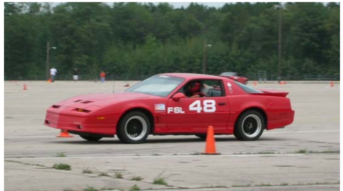
Below one old British automobile and one new German automobile that are perhaps separated by 40 years. Is it just me or do they share similar characteristics? Makes you wonder is one was ahead of their time or the other paying the ultimate complement by imitating the older design and style.