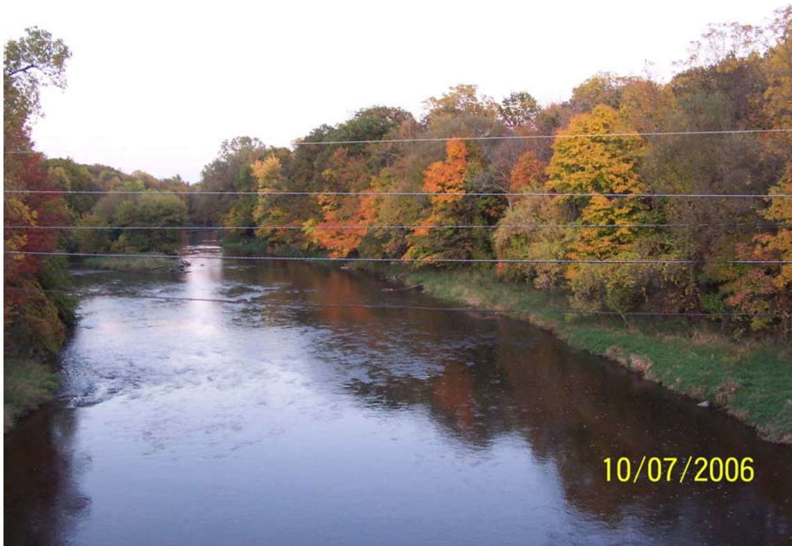
Lorien and I saw a little color on the way up to Hemlock. On the way home we stopped along the way to take a couple of pictures. This one was taken off the bridge on M52 over the Shia-