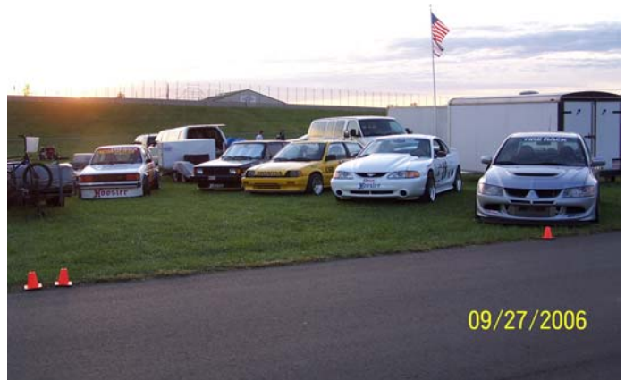
Top photo the compound at nationals. Just to the right of the view are the two easy ups . Bottom photo Tom Hudak is trading up! Just look you can tell he wants one, as does everyone else that got to drive the GT.