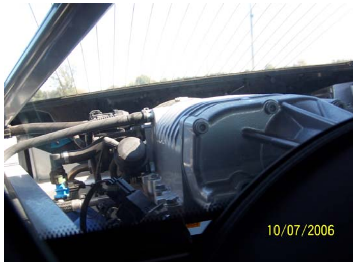
This picture was taken from the passenger seat while driving down M46. If you have the rear view mirror adjusted just right, this is what you see. Some said the car had a stereo, I thought this was it.