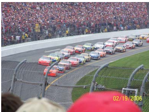
Daytona 500 field coming to the start for the green flag. Below some action in the pits. Does that one car say Little Debbie!