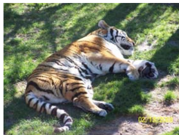
This would be the new registrar. Be nice.