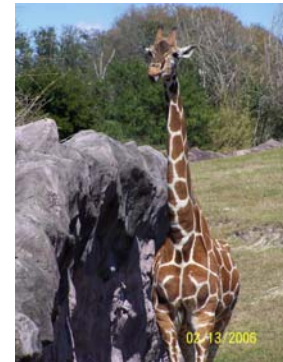
This guy will make an excellent spotter.