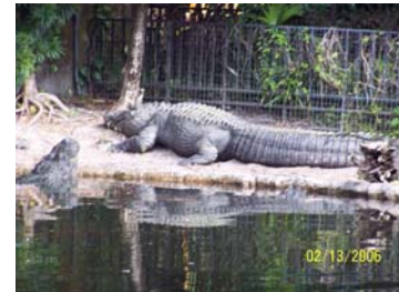
This group would make quite the protest committee. More fun on page 5