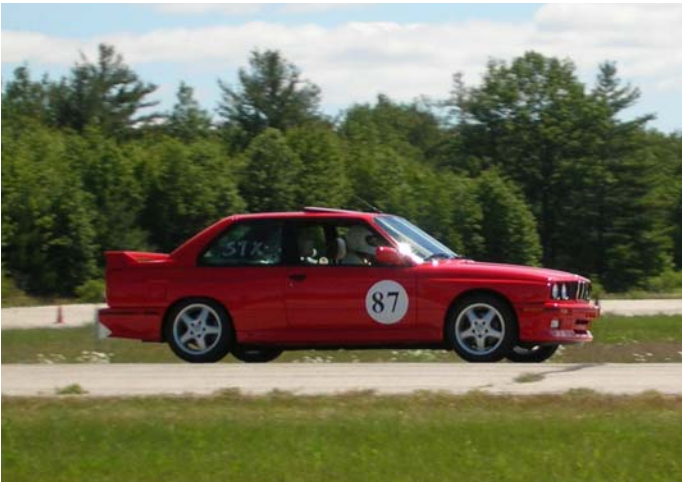
Here are a couple of snap shots from the regular competition runs at the Ladies day at the Races event at Barstow Airport.