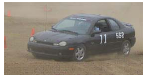
Above the Derek Fisch Neon in Stock Front Drive. Photo from file.

On page 6 you see the results for the first SVR Rally-X. Many thanks go to the people from Detroit that very patiently offered us their help and ideas as we put on this event. The biggest obstacle of the day was keeping the track from rutting up too much. Between heats Many people helped pitch in to hand rack the turns, run the ATV with the drag and move the cones to uncover fresh earth.