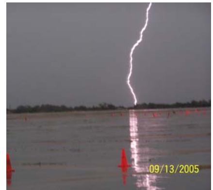
This would be how the competition got started. Runs were delayed for 2.5 hours but we did stay entertained.

As the final event of the year that brings to a end the 2005 chase for the Cup, sponsored by Showcase Mitsubishi and My Auto Events .com. Check out page 14 for the complete year end results. Congratulations to everyone who chased the cup.