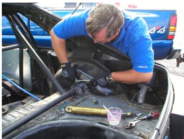
A place to work on the car with no phones and Maggie Moo's Ice Cream...Priceless.