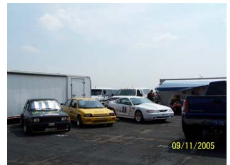
The Compound. We actually had 4 cars there (the CP Car is in the garage) 4 bikes 2 mopeds and a golf kart.