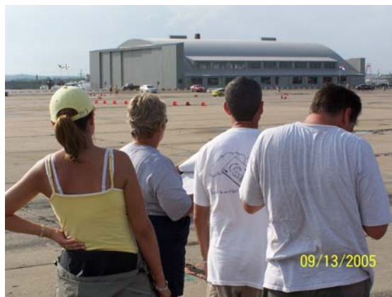
Watching the action in CSP on one of the dry times.