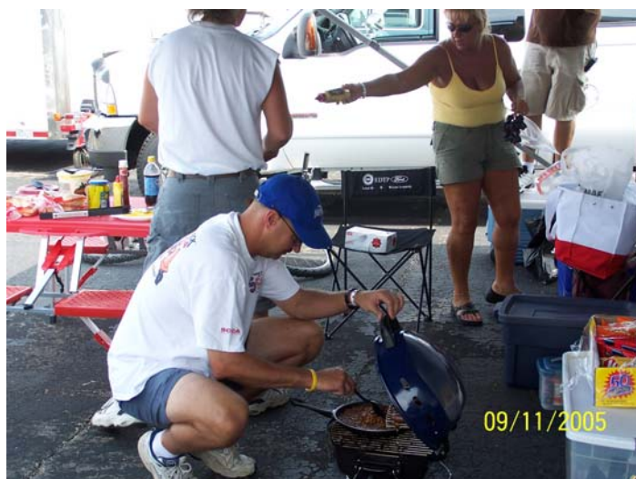
Lunch time. Lets just say the group ate well.