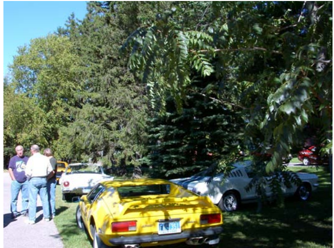
Above 4 cool cars can you name all 4? The Boss 302, a 55 or 56 Thunderbird, a 65 Shelby GT350 and Pantera. (It does not suck to be John)