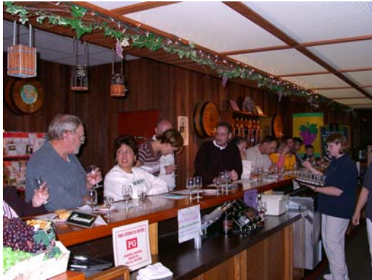
Above This would be the left side of the Bar at the wine tasting at St. Julians.