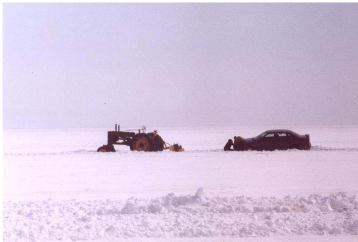
It’s not exactly AAA roadside service – but if you get stuck here – you’re not too choosy.

A few pylons help to define the course, but the snow banks actually do a better job. The penalty for leaving the cleared surface tends to be much greater than any cone hit! Several minutes can be lost while the local towing service (see John Deere) works to get your car extracted from the banks.