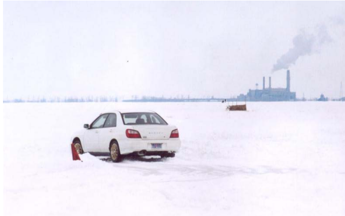
Koji Yoshioka exiting “Turn one”. In the distance are power station smokestacks in Bay City.

While the winter months bring snow and cold to the northern regions, some motorsports enthusiasts still find a way to get their kicks. This is certainly true for the Saginaw Valley Region of the SCCA. For the past few years SVR has organized and presented a series of ice runs. Think of an ice run as a Solo II (autocross) on a frozen lake. A little body of water known as Lake Huron has been the site of these ice runs in recent years. A small cove on Saginaw Bay just north of Bay City has been selected for its ease of access, seclusion and shallow water. Conditions must be just right – namely a minimum of 10 inches of ice. After that, most anything goes.